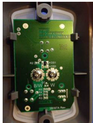
Figure 1 (Rear of Series II Wall Console)

The miDoor device can replace this controller or can be tied into and co-exist with it. For the miDoor device to co-exist with the existing controller attach a wire to each screw terminal (labeled as B/W and W) and attach the other end of the wires to the miDoor device as illustrated in the following picture.