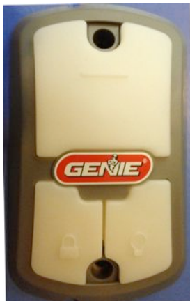
Figure 2 (Series II Wall Console)

Many of the Genie garage door openers come with the Series II Wall Console as shown below: