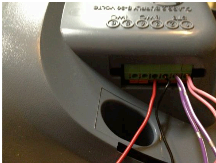
Figure 4 (Wires to the Opener. Red & Black attach to the Wall Controller/miDoor device.

It is assumed that the wires that lead to the wall controller are attached to the terminals labeled as 'BWC' on the garage door opener. Pictured below is a sample configuration. The pink and purple wires attach to the Safe-T-Beam® (STB) system while the red wire attaches to the B/W terminal on the wall controller and the black wire attaches to the W terminal on the wall controller. The color of the wires will vary depending on your installation; we chose these colors for illustration purposes. What is important is that the wire from the #4 terminal block on the opener must go to the B/W terminal on the Series II Wall Controller and the wire on #3 terminal must go to the W terminal on the Series II Wall Controller. In the illustration in this guide the red wire attaches from the #4 terminal to the B/W terminal and the black wire from the #3 terminal to the W terminal.